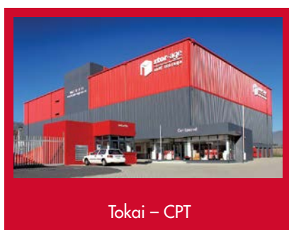
Tokai – CPT