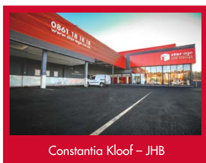
Constantia Kloof – JHB