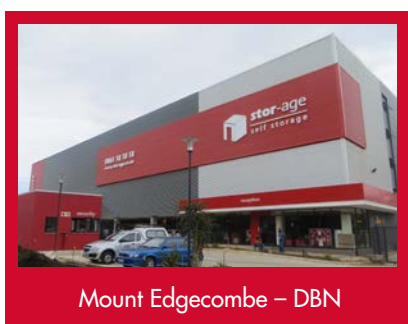
Mount Edgecombe – DBN