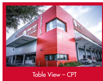
Table View – CPT