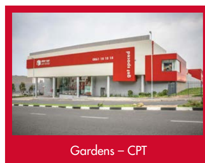
Gardens – CPT