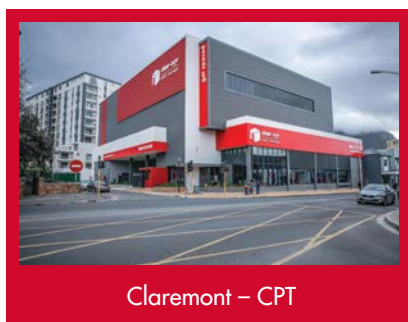
Claremont – CPT