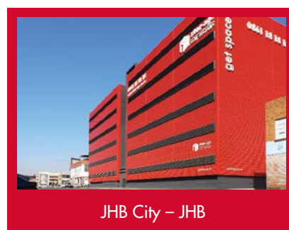
JHB City – JHB